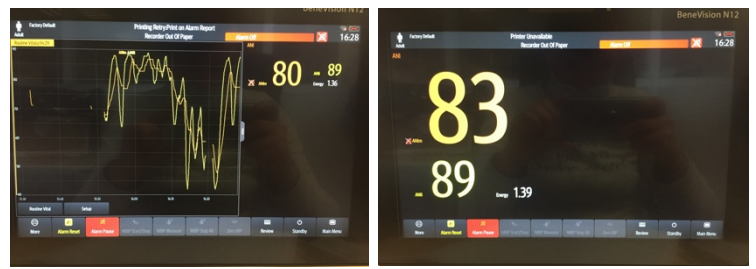
The ANI module window shows the information about the measurement acquired by ANI-MR. Three parameters are provided by the module:

When multiple technologies are connected to the BeneVision<sup>TM</sup> monitor, each technology's parameters are displayed in an individual window. The relative size of each window can be configured using the "Setup" feature, which is accessible by pressing the "Setup" button in the main menu or in the ANI window. For more information, please read Operator's Manual for BeneVision<sup>TM</sup> monitor.